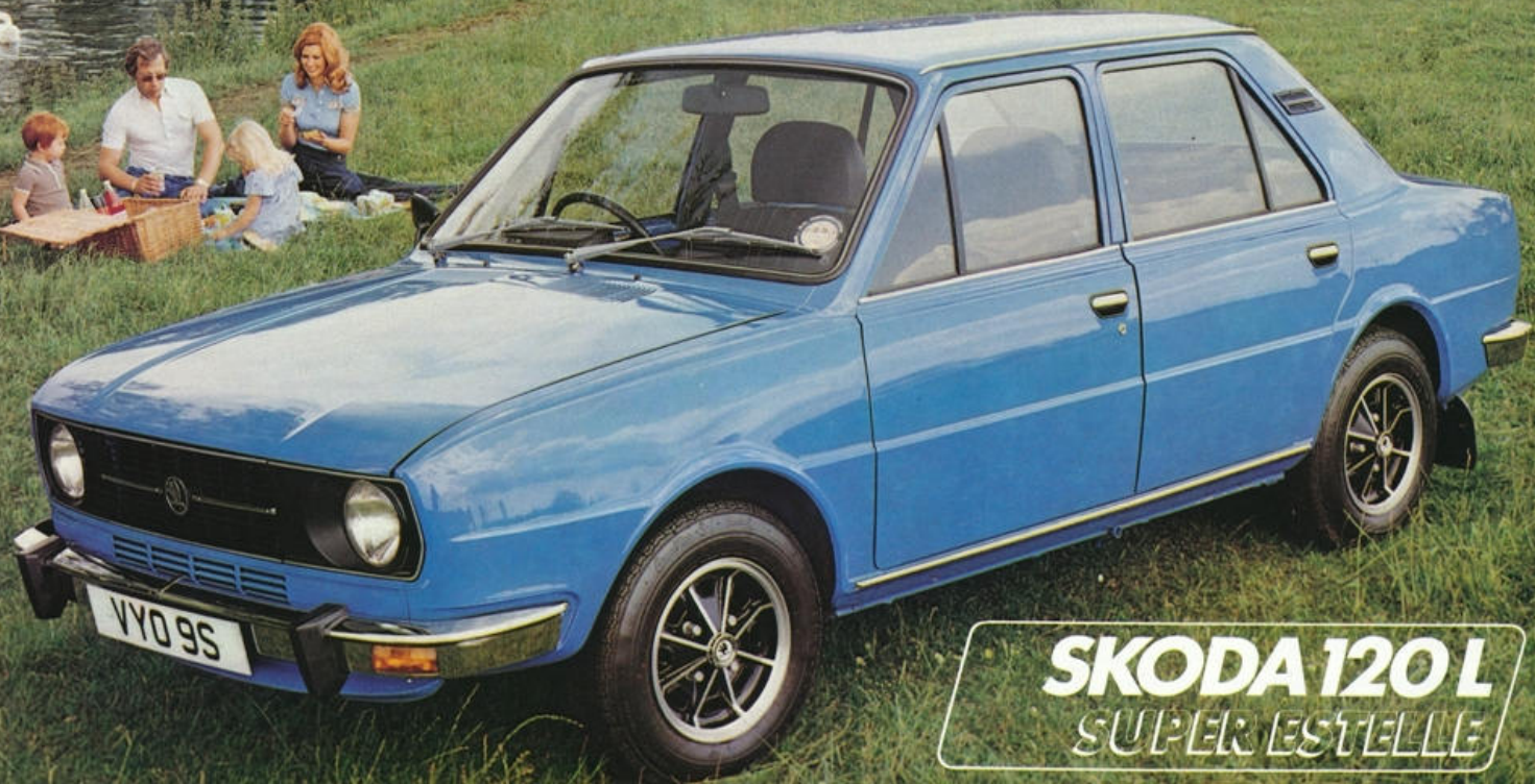
SKODA 120 L SUPER ESTELLE